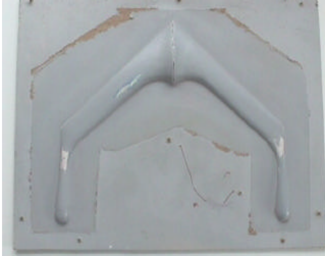
The Wood and Plaster Pattern