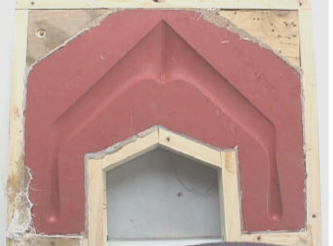
The Silicone Rubber Mold

I made the inside of this pitot tube with 1/4" aluminum tube bent to match the streamlined shape. The aluminum tube is not the best or most reliable electrical conductor, so I wrapped the tube in adhesive copper foil. I removed the leads from the PTC thermistors with a soldering iron. The faces of the PTC "pellets" were then soldered on, corncob fashion, to the nose end of the pitot tube. Breaking the pellets into D-shaped parts would have made placement easier and would have done no harm to the PTC.