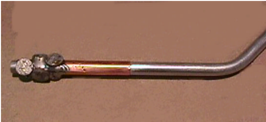
Nose with Soldered on PTC Thermistors

I made the inside of this pitot tube with 1/4" aluminum tube bent to match the streamlined shape. The aluminum tube is not the best or most reliable electrical conductor, so I wrapped the tube in adhesive copper foil. I removed the leads from the PTC thermistors with a soldering iron. The faces of the PTC "pellets" were then soldered on, corncob fashion, to the nose end of the pitot tube. Breaking the pellets into D-shaped parts would have made placement easier and would have done no harm to the PTC.